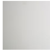
OP71 matt white