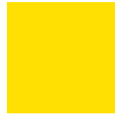
OP86 matt yellow