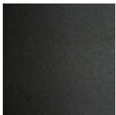
GFM69 graphite embossed