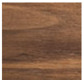
NC walnut canaletto