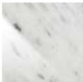
BC polished white Carrara