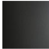
OP69 matt graphite