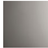
polished stainless steel