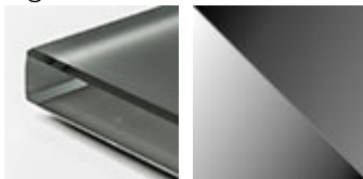
extra clear frosted glass graphite painted