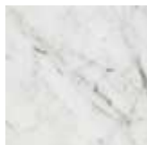
BCO matt white Carrara