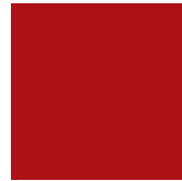
OP89 red corsa