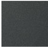
GF69 embossed graphite