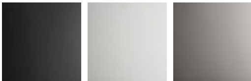
OP69 matt graphite