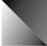
KM24 matt Invisible