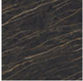
KM07 matt Portoro