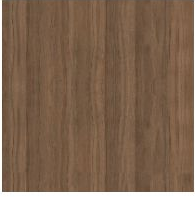
Veneered wood Walnut Canaletto