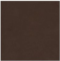
Painted metal Mat bronze