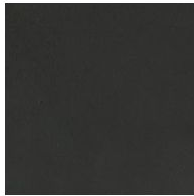
Painted metal Mat lead

Materials, fabrics, leathers, colors and finishes are approximate and may slightly differ from actual ones. You can find the complete collection of Bonaldo fabrics and leathers on the website