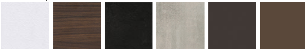
LM02 climb white