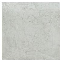
Concrete Travertin look