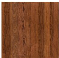
Solid wood American walnut