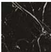
NM polished black Marquina