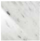
BC polished white Carrara