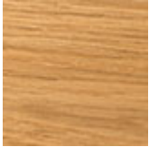
frN natural ashwood