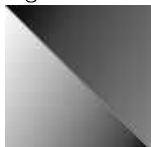
extra clear graphite