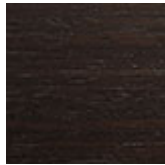
frRB burned oak stained ashwood