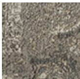
cotton chenille Chennai