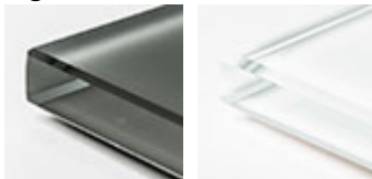
extra clear frosted glass graphite painted