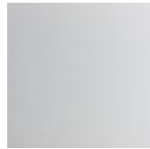
GFM71 white embossed