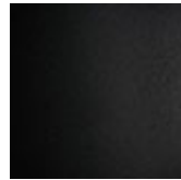
GFM73 black embossed