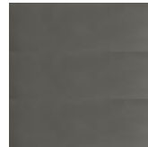
OP0 transparent varnished