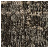
cotton chenille Mapoon